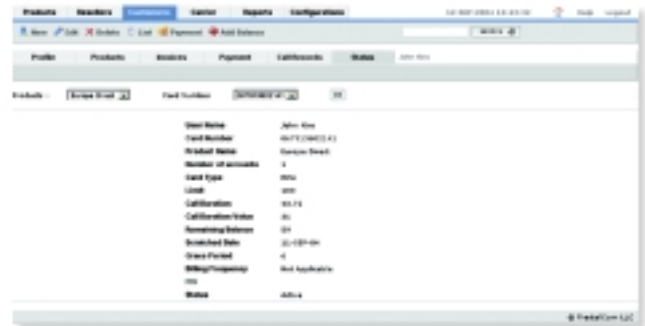
Product User Status